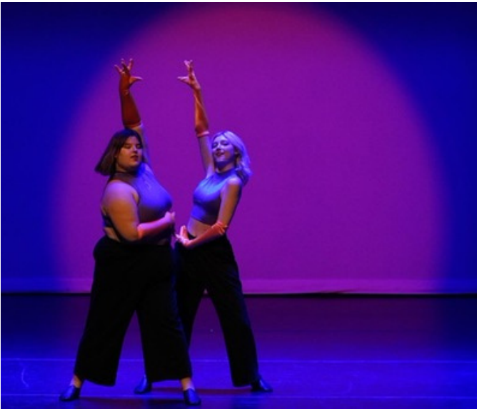
Performers from our Dance Pathway courses

Hopefully you were able to attend. The concert was a pure delight!