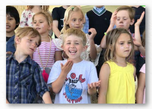
At least 45 minutes each week in all grade levels