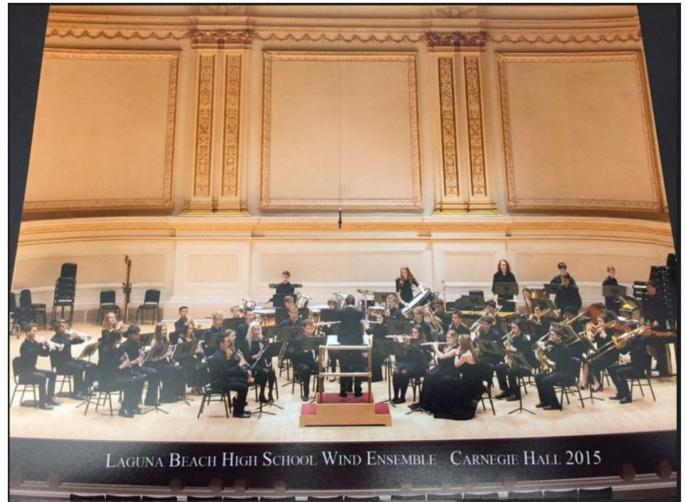
LBHS Students at CARNEGIE HALL Wind Ensemble Class 2015